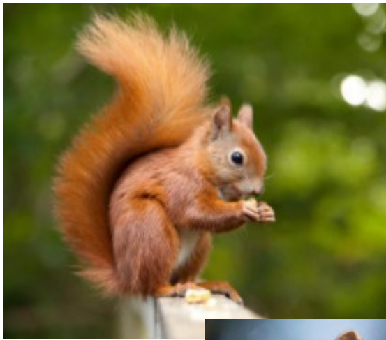
A red squirrel